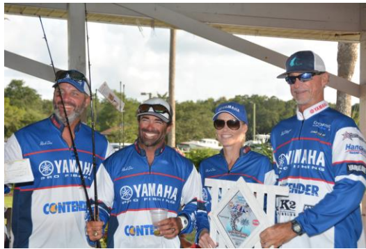
Team ROC DOC 2017 Winners of the King Mackerel Division