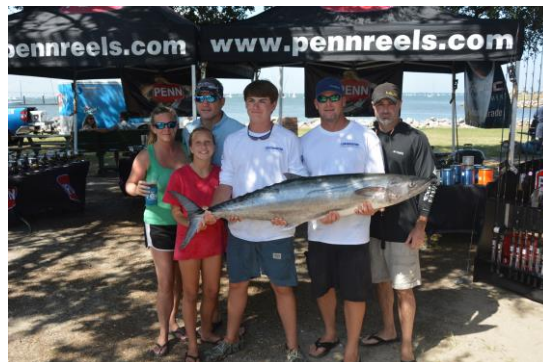
Team NautiGul 2016 First Place Winners –SKA State Record 53.25lb