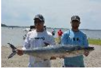
Team Little Lure 2019 1 st Place King Mackerel Division 43.60lb