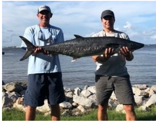
Team Sperry/Net Profit 2018 1 st Place King Mackerel Division